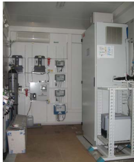
LAFARGE CEMENT, Trbovlje cementarna AMS: CO, NO, NO 2 , SO 2 , HCl, HF, TOC, H 2 O, O 2 , CO 2 , prah, F, T, P