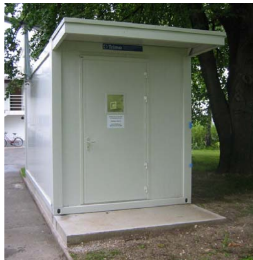
NOVARTIS, LEK Mengeš, naprava za sosežig toplil AMS: CO, NO, NO 2 , SO 2 , HCl, HF, TOC, H 2 O, O 2 , CO 2 , prah, F, T, P