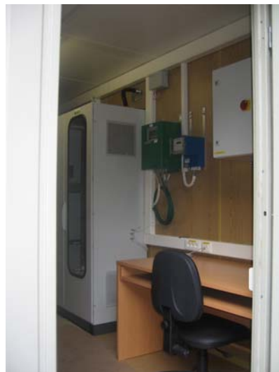
VIPAP VIDEM, Krško Kotel K4, AMS: CO, NO, SO 2 , O 2 , prah, F, T, P