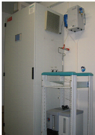
NOVARTIS, LEK, Lendava sežigalnica odpadkov AMS: CO, NO, NO 2 , SO 2 , HCl, HF, TOC, H 2 O, O 2 , CO 2 , prah, F, T, P