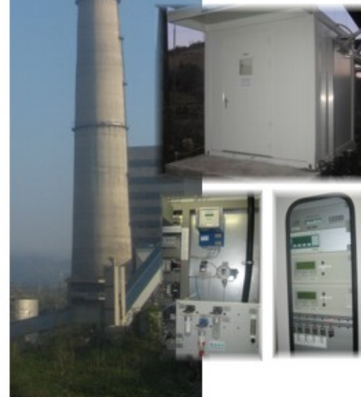
TERMOELEKTRARNA Pljevlja, Pljevlja Črna gora AMS: CO, SO 2 , NO, O 2 , CO 2 , O 2 , prah, F, T, P