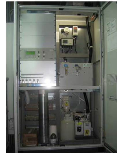
BHKW, Sulzbach-Rosenberg, Nemčija kotel na biomaso AMS: CO, NO, O 2 , prah, F, T, P